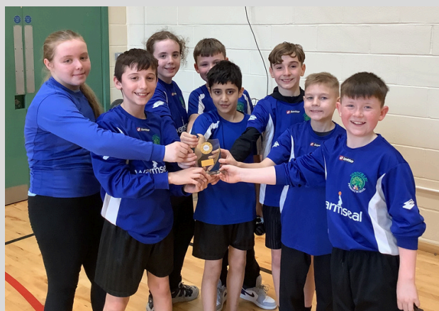
Throckley Primary - Basketball