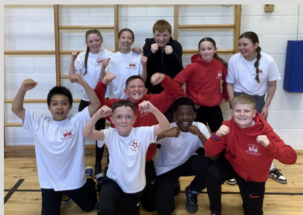
Milecastle Primary - Dodgeball